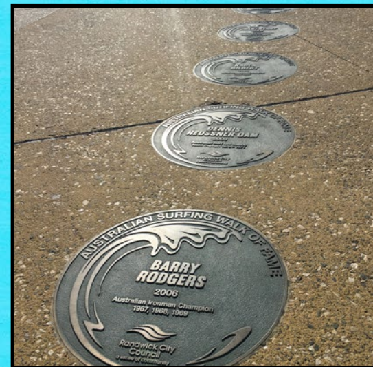
Australian Surfing Walk of Fame at Maroubra Beach

Competed on World Surfing Tour 1976-1979, established Maroubra Board Riders 1974, pioneer of pro-surfing & local role model and outstanding contribution to Surfing